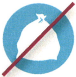
Do Not Bag Recyclables No Garbage