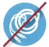
No Tanglers (no hoses, wires, chains or electronics)