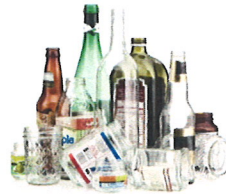
Bottles and Jars empty and rinse