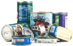
Food and Beverage Cans empty and rinse