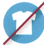
No Clothing or Linens (use donation programs)