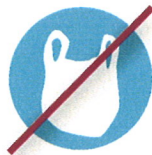
No Plastic Bags or Plastic Wrap (return to retail)