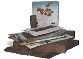
Mixed Paper, Newspaper, Magazines, Boxes empty and flatten