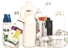
Bottles, Jars, Jugs and Tubs empty and replace cap